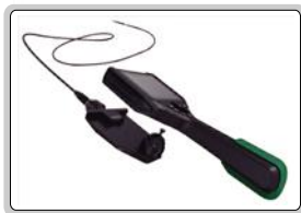
changeable lens cable