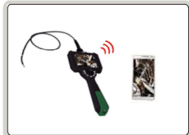
WIFI real-time image transmission